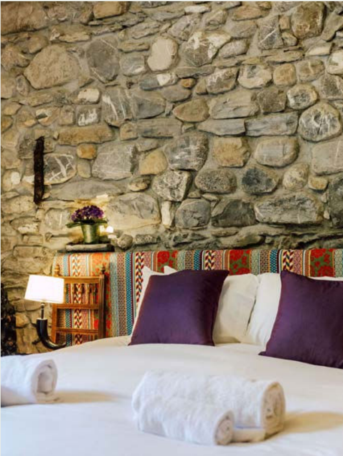
MANOR HOUSE ROOM

CELL was the town's jail in times of trouble