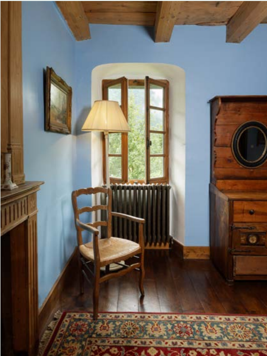
MANOR HOUSE ROOM

BLUE is perfect for honeymoons and romantic stays